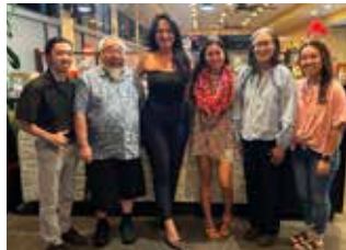
Aeva with Ikeuchi Family Sponsors