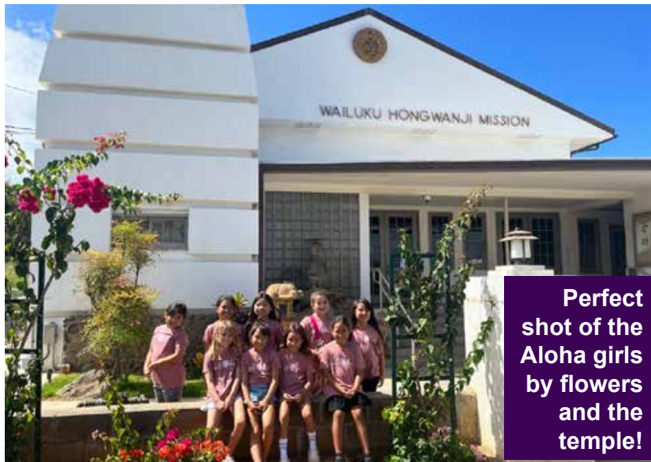
Perfect shot of the Aloha girls by flowers and the temple!

Next month, please join us for 4-H Sunday at 8am with refreshments to follow!