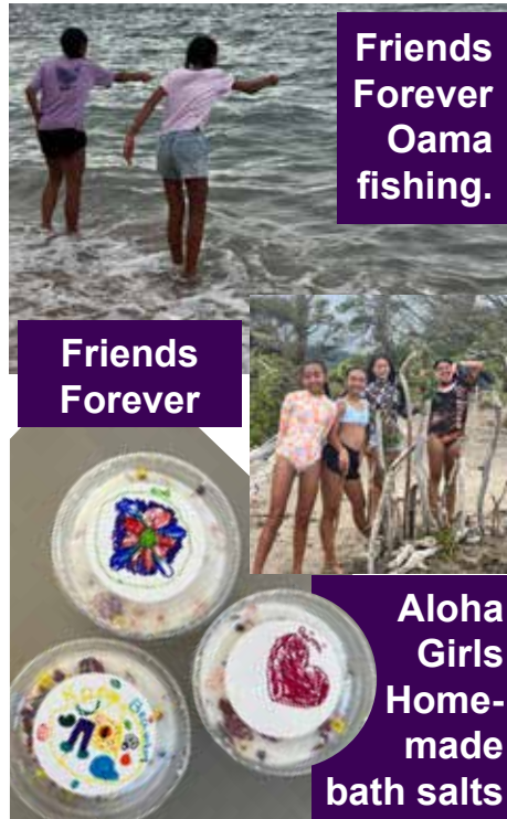
Friends Forever Oama fishing.

The Friends Forever 4-H Club camped at the Waihe'e Refuge during the Labor Day weekend. They cooked, went hiking to the Waihe'e Stream, swam in the freshwater stream, roasted marshmallows over