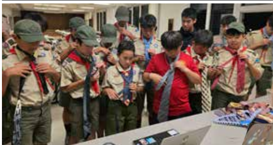
The troop boys learning how to tie a necktie

Boy Scouts had a Cub Scout graduation camp, an eagle scout project, summer camp, and a service project.